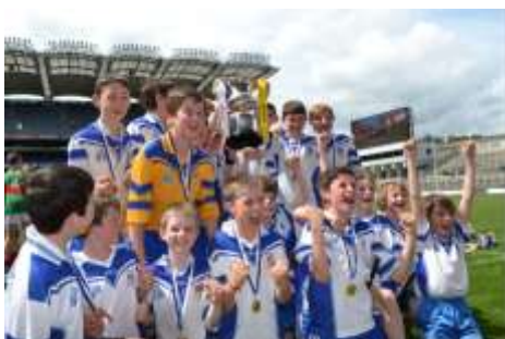
Craobh Iománaíocht 2014

The School's Anti-bullying policy will be published on the school website before the end of this month.