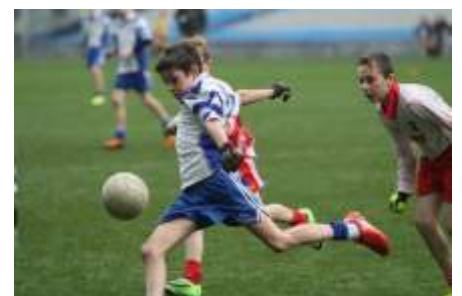
Craobh Peile 2013

The girls play St Marks, Tallaght this afternoon and the boys will take on Rolestown NS, Swords in Clanna Gaels pitches in Ringsend next week.