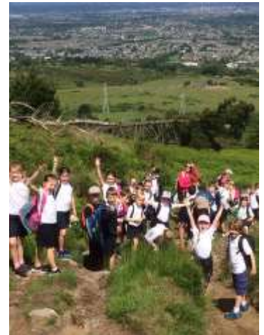
R2 ar Shiúlóid Sléibhe suas Sliabh Rua