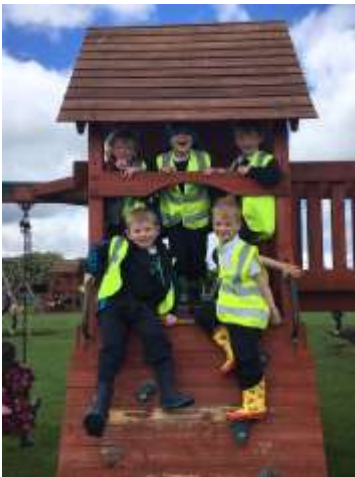
N1 ar cuairt ag Feirm Ghleann Rua