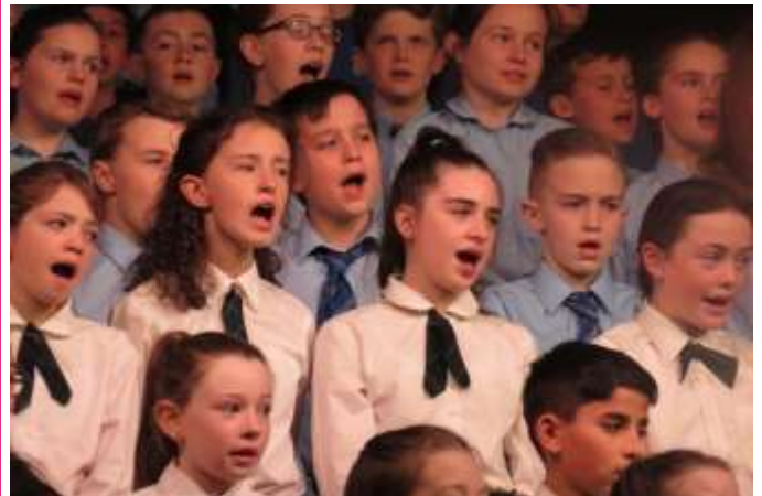
Daltaí Gaelscoil Thaobh na Coille ag canadh sa Cheolchoirm Réigiúnach i dTamhlacht in Aibreán 2019 (roimh Covid!)