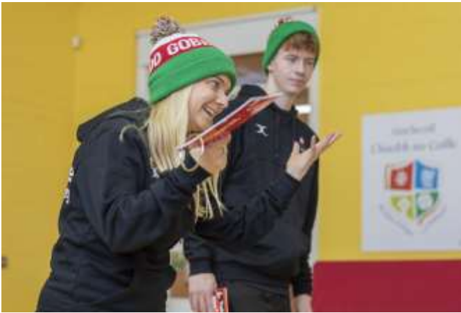
Baill d'fhoireann Urdd ag stiúradh na ndaitai