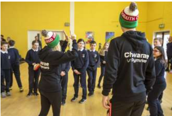
Chwarae yn Gymraeg - Ag Imirt tré Bhreatnais

The icing on the cake for the pupils in R5 was being featured on Nuacht TG4 that evening and also in the Irish Independent & The Irish Times (on-line) the following day!!