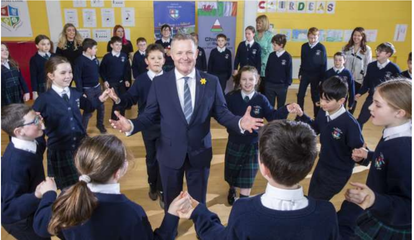
Aire Oideachais na Breataine Bige, Mr. Jeremy Miles ar cuairt ag Gaelscoil Thaobh na Coille ar Lá Fhéile Naomh Daithí