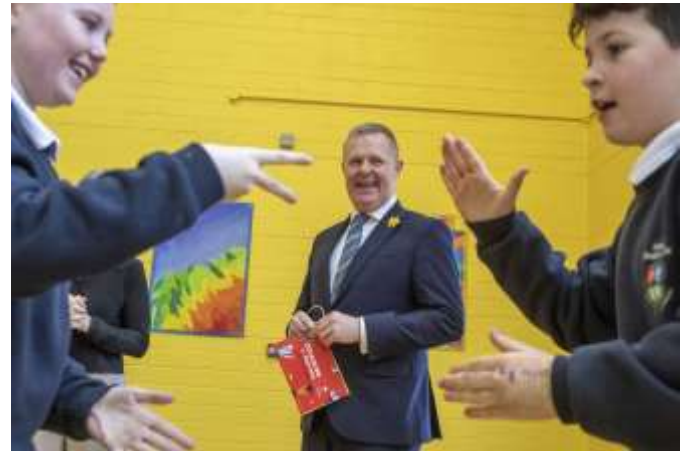
An tAire Oideachais Jeremy Miles ag breathnú ar na páisrí ag spraoi tré Bhreatnais