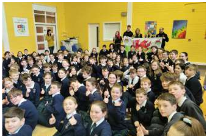
Tionól Scoile do Lá Naomh Daithi