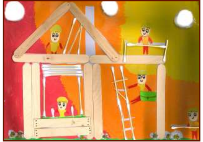
Cúigear Fear ag Tógáil Tí: Éile Chambers R2A