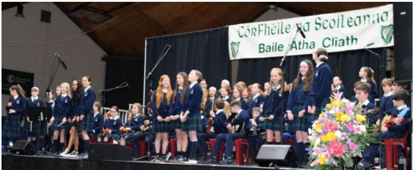
Banna Ceoil na Scoile ar an ardán sa Lárionad Náisiúnta Cispheile i dTamhlacht ar an 4 Márta