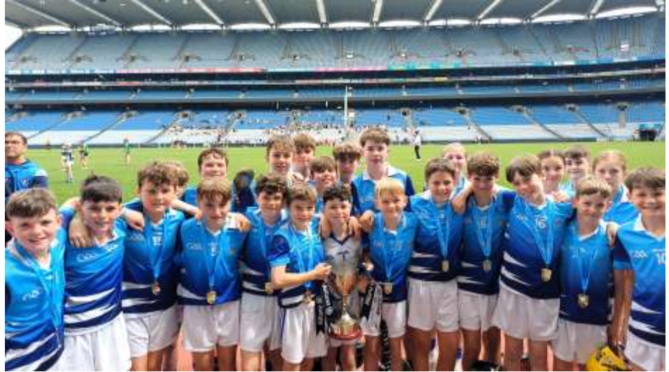
Foireann Iomána na Gaelscoile i bPáirc an Chrócaigh