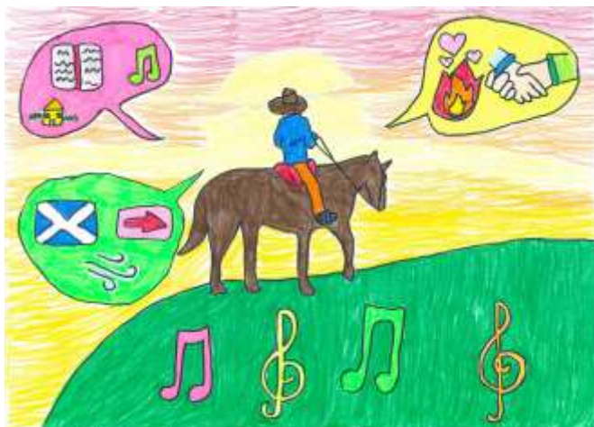
Caladonia - Róisín Pléimeann R5A