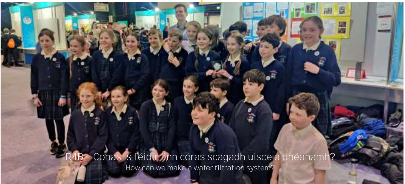
R4B: Conas is féidir linn córas scagadh uisce a dhéanamh? How can we make a water filtration system?

The children put in a huge effort into the project work and they really enjoyed the whole experience. Both classes presented a very impressive visual display of their project and were highly recommended by the judges. The children really enjoyed the day. Congratulations on your achievements a pháistí!