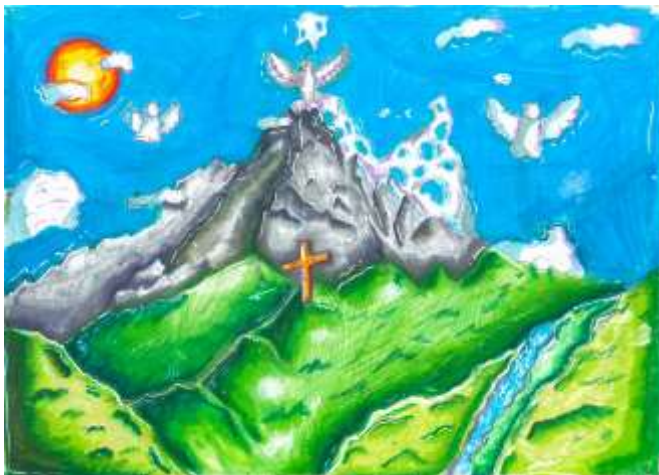
Cantate Domino Alleluia - Jude Holden R6A

A National Art Display is being held in conjunction with the concerts as part of the 40 th anniversary celebrations. Each participating student was asked to create an A3 picture of a particular song. Each school was allocated 4 songs from the repertoire which the pupils could choose from and schools were asked to return one picture representing each of our allocated songs to the National Committee. Our songs were: Caladonia, Mo Ghile Mear, Thankful and Cantate Domino Alleluia. We were thrilled and extremely proud to see two artworks created by pupils from Gaelscoil Thaobh na Coille included in the visual display that was shown during the performances in Tallaght. They were Cantate Comino Alleluia by Jude Holden R6A and Mo Ghile Mear by Katie Ní Chorráin R6A.