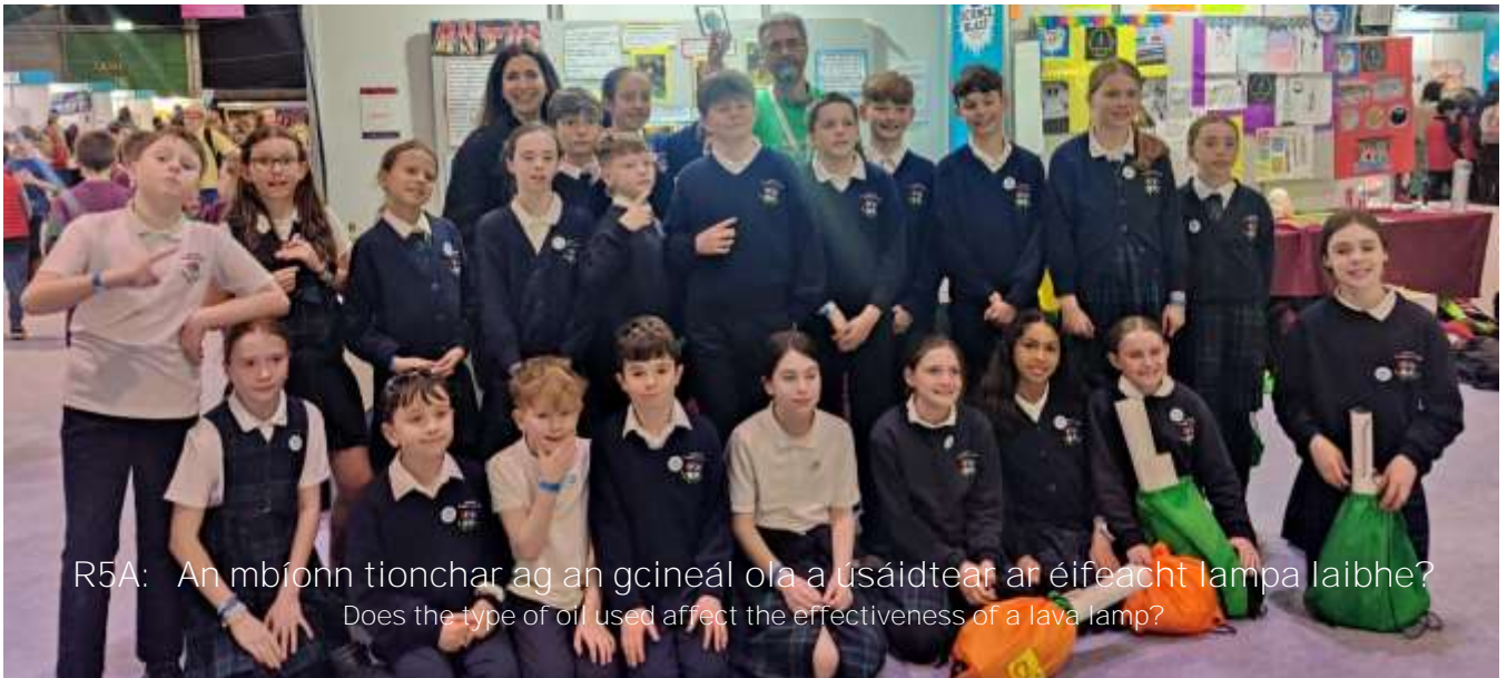
R5A: An mbíonn tionchar ag an gcineál ola a úsáidtear ar éifeacht lampa laibhe? Does the type of oil used affect the effectiveness of a lava lamp?